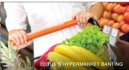
LOTUS'S HYPERMARKET BANTING